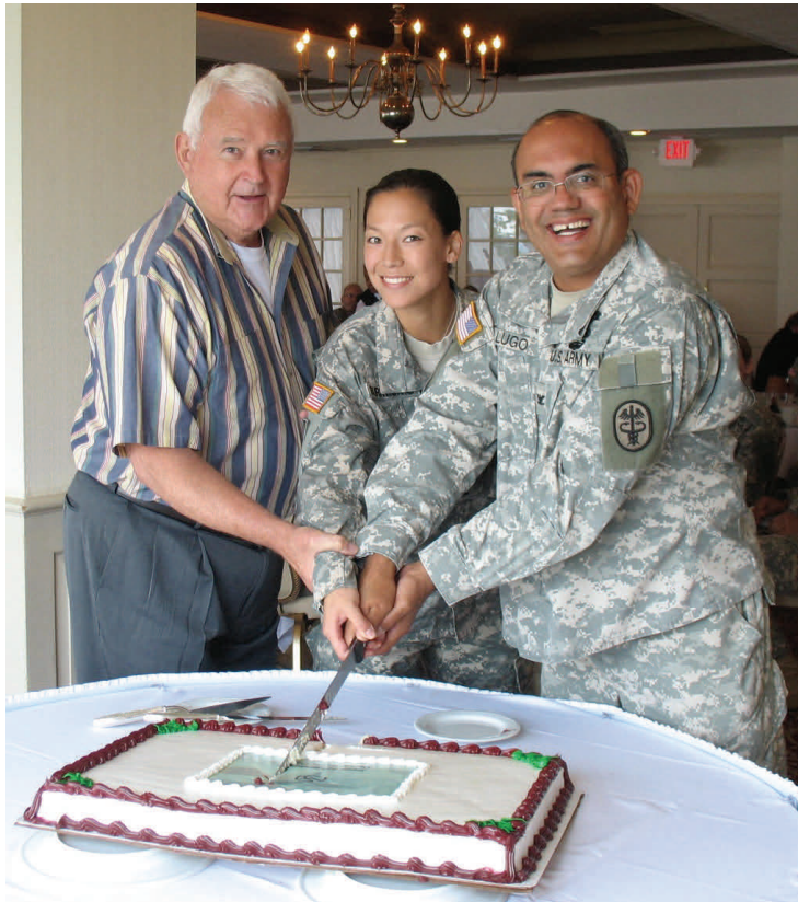
MSC 95th Birthday Cake Cutting Ceremony at SCA NCR Luncheon at Ft Belvoir Officers Club